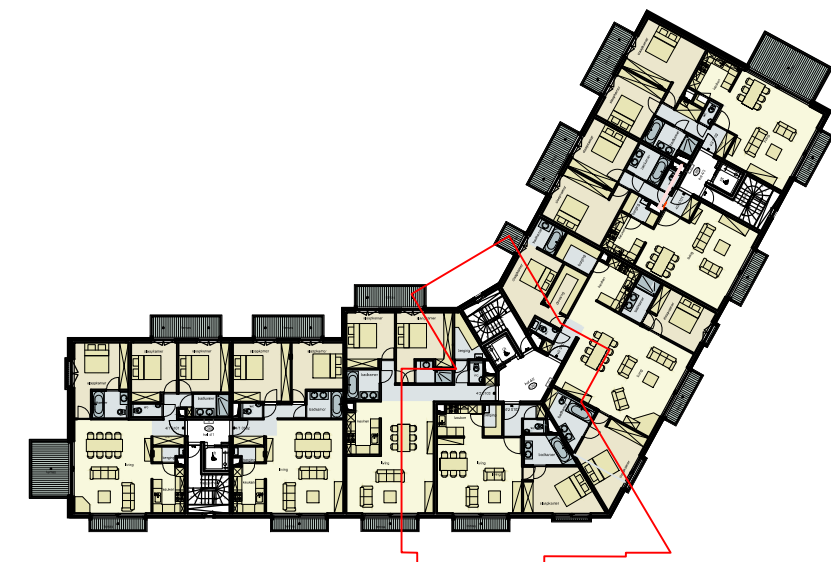
Positie in bouwblok, schaal 1/500